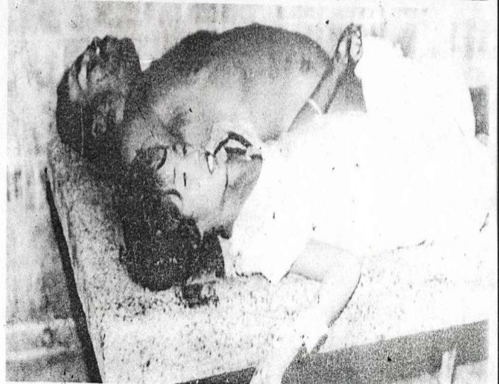
A father and daughter killed in cold blood by the attackers who stormed Janakapura settle in a manical frenzy.