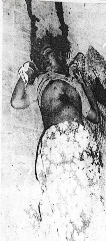
Another victim of the savage LTTE assault on Janakapura settlement. This young mother was cruelly struck down by the terrorists and her children were abducted.